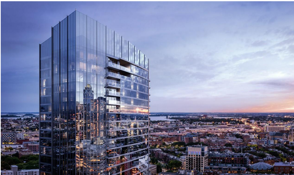
Raffles Boston Back Bay Hotel & Residences, currently under construction in Copley Square, will be the first mixed-use Raffles in North America. It will also be the first hotel in Boston with a "Sky Lobby".

This is often done for practical reasons especially in high-density urban environments where street level retail is often too valuable, the available site area too small, and the street views too limited to devote to lobby functions. The solution is often a modest street level elevator lobby from which guests can be whisked to an upper floor where the opportunities for light, space and vista are available.